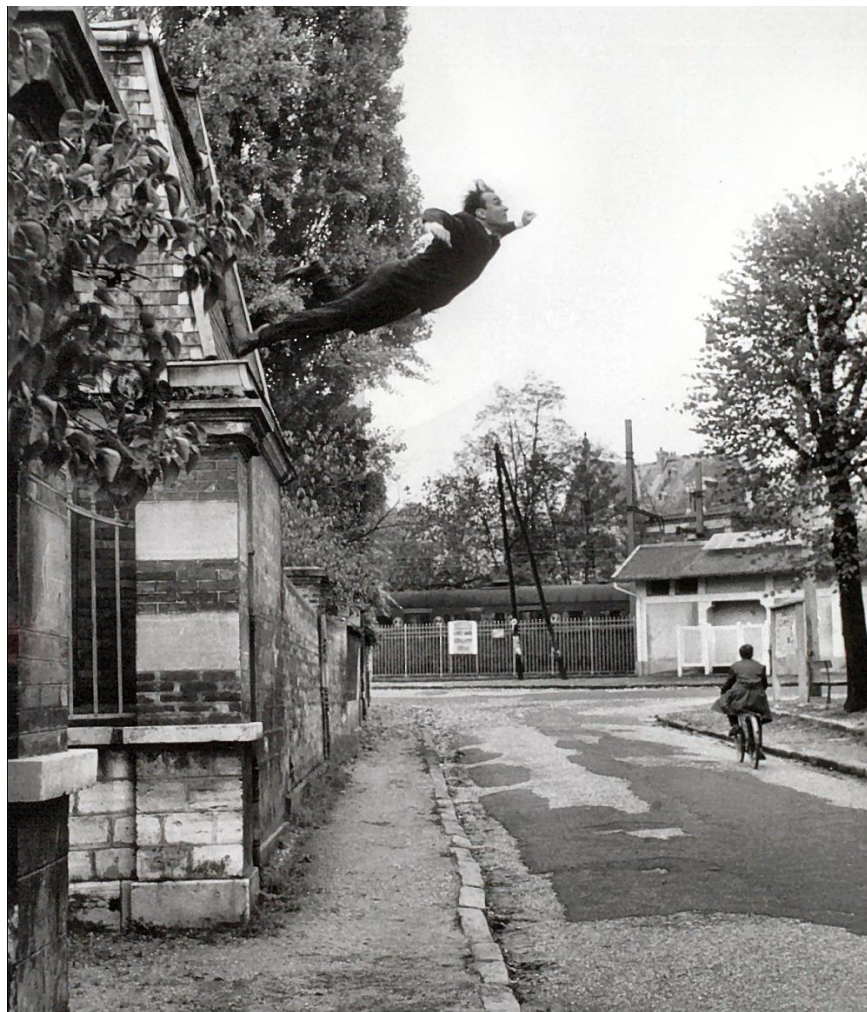
Yves Klein, Le Saut dans le Vide , 1960